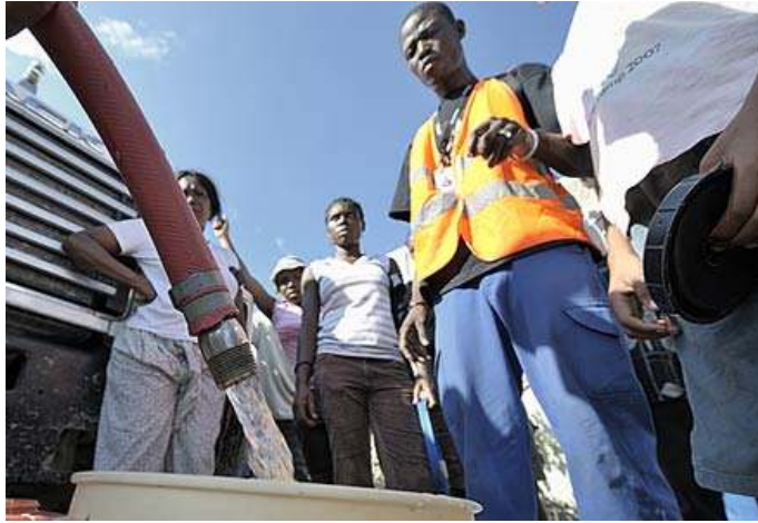
Families fill their buckets with water from a truck in the Bel Air neighborhood of Port-au-Prince, where the ACT Alliance is setting up water treatment and distribution systems.